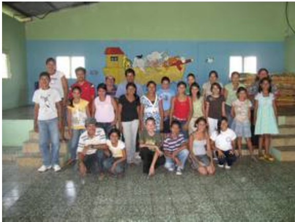
September 2009 Picture of Osman Hope Scholarships Program Students and their Parents from Sta Cruz Shelter