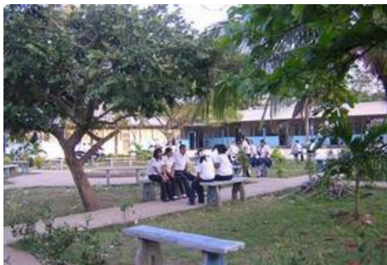
Students Studying in the Popol Vuh School in Sta Cruz

"Give a man a fish and he eats for a day. Teach a man to fish and he eats for a lifetime." Confucius