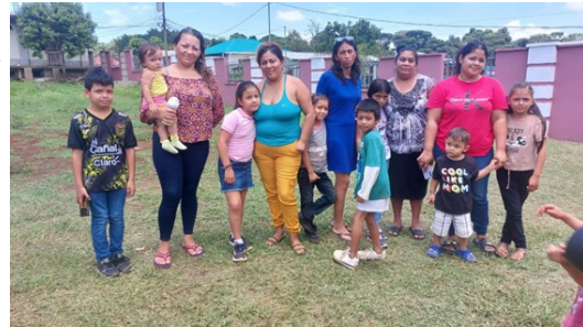
Family members from the La Cosech shelter

When we started Osman Hope almost 25 years ago we had no idea what we were getting ourselves into. Through the grace of God, many prayers and our loyal donors, the Osman Hope family has been able to break the cycle of poverty with numerous kids and their families. As you read the newsletter, it is obvious that the Hand of God has led us on this journey. As we proceed to add a fourth shelter, we encourage all of our followers to spread the word about Osman Hope and help us on our journey to care for those who, not by their choice, were born into poverty. We are only limited in helping more children by the funding that we receive. Our website is www.osmanhope.org . Osman Hope is a 510(c)3. 100% of all donations made to Osman Hope go to the care of the children. The Board of Osman Hope covers all overhead costs.