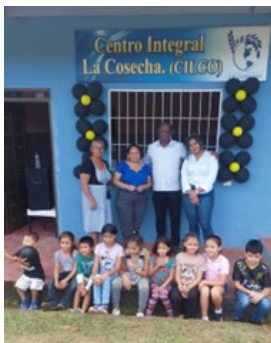
The La Cosecha Shelter