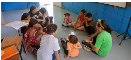
Kids in study and prayer groups

I am happy to report that everybody is pretty much on track. Just one or two of them are on probation. However, they have until the end of the year to raise their grades to qualify for a scholarship for the following year. We require an 80% average for them to be able to receive the colegio scholarship. A colegio scholarship is very helpful for the parents as it pays for school supplies, uniforms and any enrollment expenses.